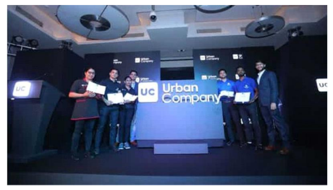
Exhibit 2: Urban Clap is now Urban Company