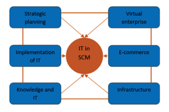
Figure 1 Network of IT in Supply chain

The difficulty of SCM compels businesses to follow Telephone, Internet and World Wide Web contact methods. The long-term advantages of all supply chain members are shared. In order to minimize confusion, it should be improved to exchange information through EDI (Electronic Data Interchange) technologies. Companies are spending massive money to get a production network empowered by IT. The following issues are discussed in IT-integrated SCM[17]