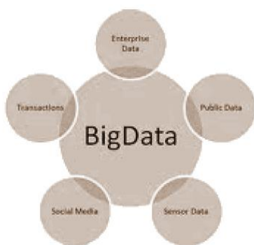
Fig 1: Big Data

The explosion of big data is testing the variety [1] [5], and velocity of this flood of complex, capabilities the explosion of big data is testing the variety [1] [5], and velocity of this flood of complex, capabilities of even the most advanced analytics tools. IT is challenged by the sheer volume, structured, semi structured, and unstructured data which also offers organizations exciting opportunities to gain richer, deeper, and more accurate insights into their business.