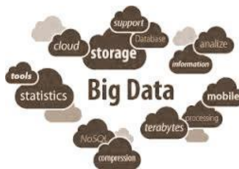
Fig 1.1: Big Data

Big data is typically described by the first three characteristics. The term big data is believed to have originated with Web search companies who had to query very large distributed aggregations of loosely-structured[23] data. Big data analytics requires capturing and processing data where it resides. This paper explores the value of data at the edge of networks, where some of —biggestl big data is generated. As the use of sensors and devices as well as intelligent systems [4] [5] [6] continues to expand, the potential to gain insight from the flood of data from these sources becomes a new and compelling opportunity. Businesses that can harness the power of big data at the edge and unlock its value to the organization will outperform their competitors with greater capabilities to innovate creatively and solve complex problems whose solutions have been out of reach in the past. Below-sometimes referred to as the three Vs. However, organizations [6] [7] [12] need a fourth—value—to make big data work.