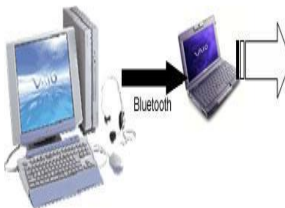
Fig 3.1: A Set up of Communication for Other Protocols

Now the computers can be put away from each other but the communication continues using the session of Bluetooth that was established previously.