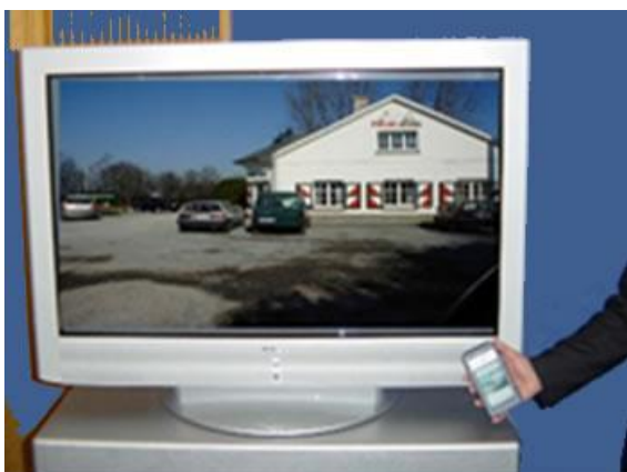
Fig 2.1: Show Picture on Big Screen.

Let's take another example. If you have a PC and a mobile phone equipped with NFC, you can easily download a new game from a website directly onto this mobile phone for your kid using NFC. And this same principle will work for any sort of data transfer between two pieces of equipment when they support NFC. There is no need to set up communication manually provided that the applications are capable of handling the communication. This opens countless possibilities for content transfer and management of personal data stored within different types of consumer electronics equipment.