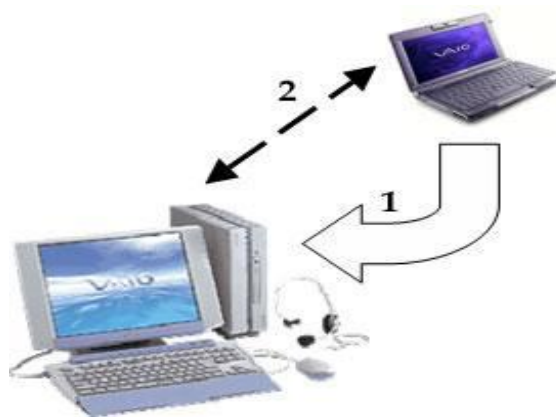
Fig 3: A Set up of Communication for Other Protocols

Touch the computers at the “hot spot”. They will open a connection to exchange the parameters of the Bluetooth communication and establish a secret key. The Bluetooth communication is established as a second step of this procedure without any human interference using the exchanged parameters.