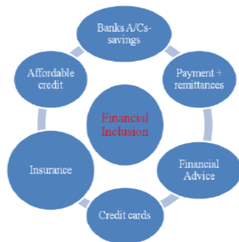
Fig: 2. Financial Inclusion

And just to help these above categories and person, rural banks are playing a vital role by introducing the concept of financial inclusion which means first understand the needs of the rural people and then support them in the best way at an affordable cost.