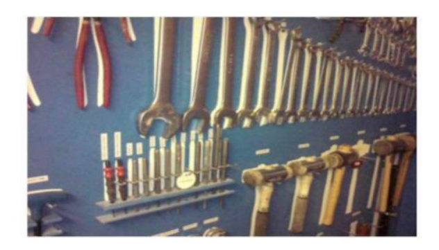
Fig 2: Shadow Board Displaying all the Equipment and tools at its Right Place

designing tool boards, parts container and improving workplace design. The practice of shadow boarding can be quickly identify when a piece of equipment is missing from a work station (Becker 2001). The main advantage of tool "shadowing" is that people instantly know which tool is missing and where it stored. Further more if one is missing its easy to guess what shop users are looking for and where it belongs.