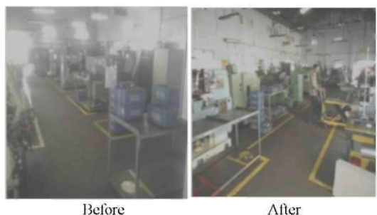
Fig 10: Marking and Standardization of the Templates with different color codes, (each color code specifies a particular company/product which helps in minimizing the problem of dispatching the different product to other company).