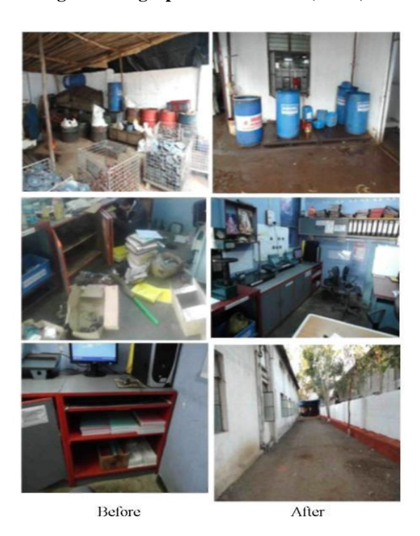
Fig 9: Photographs of 3S-SEISO (Shine).