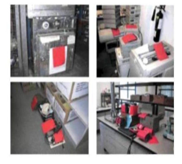
Fig 6: Red Tag Zones