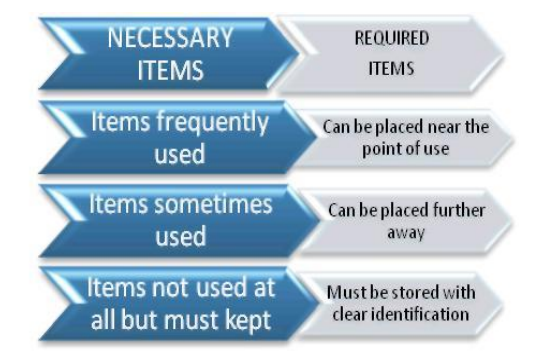
Fig 4: Second S Action Plan

The process shown in Figure 4, eliminates waste in production or in clerical activities and ensures all materials, tools and equipment have designated locations which are easy to find.