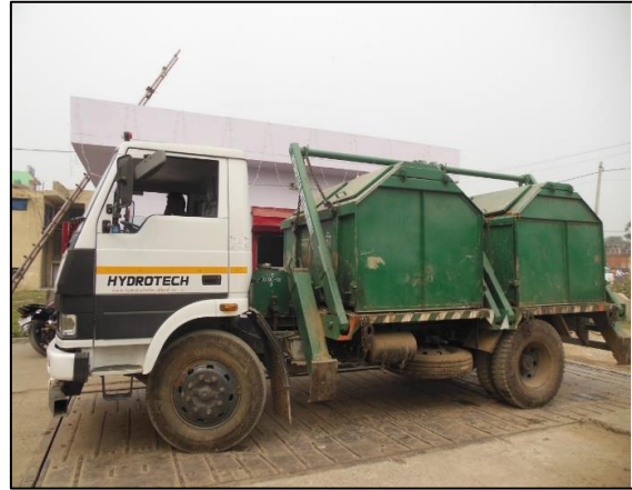
Fig 2b: Dumping Vehicles