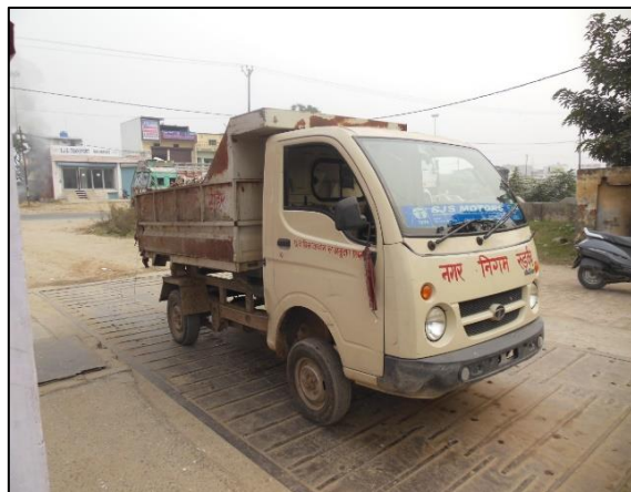
Table 1: Vehicle Carrying MSW