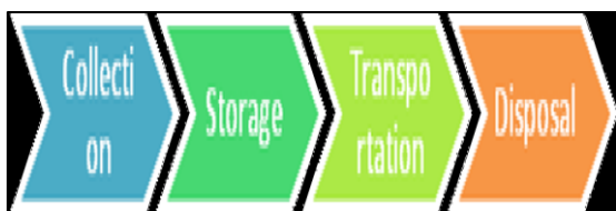
Fig 1: MSW Methodology used in Roorkee City

Door to door primary collection by engaging private sweepers. Waste is mostly collected through community bins/containers and road sweeping. Sweepers and sanitary workers engaged by the Roorkee Nagar Palika Parishad (RNPP) sweep the streets. They accumulated the collected waste into small heaps and subsequently loaded manually or mechanically onto the community containers/bins or directly loaded onto the solid waste transportation vehicles for onward transportation to the disposal site. RNPP presently utilizes the vehicles and equipment for transportation of solid waste.