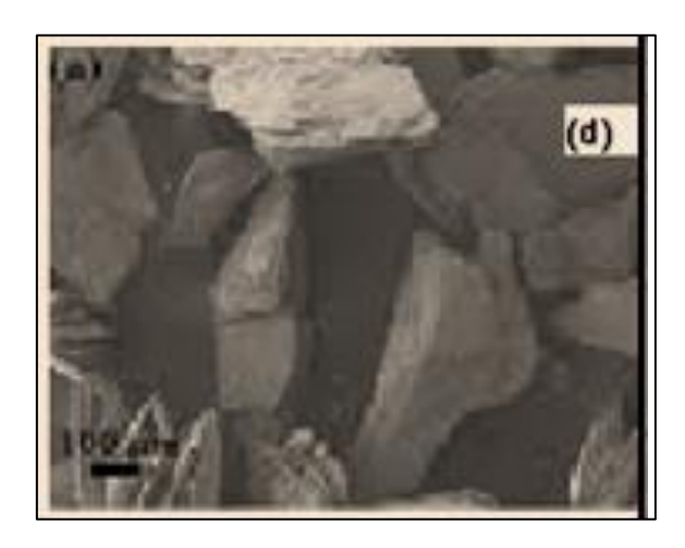
Fig: 1. SEM of Vermiculite at Magnification 1800x (15kV)

The FTIR spectra of VC suggests the main bands at 1020 cm-1 and 1080 cm-1due to Al-O bond stretching, the bands are also observed at 3500 and 3400 cm-1 due to O-H bonds in VC (Fig. not shown here). The XRD spectra confirm crystalline structure of VC. (Fig.2)