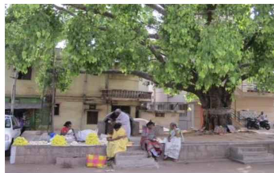
Figure 8: Change of Usage of Space with Changing Times