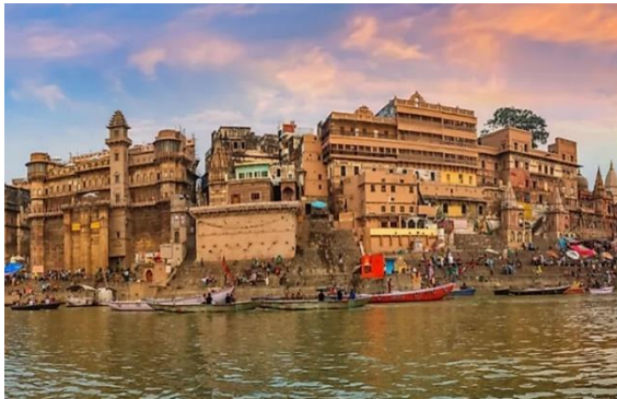
Figure 9: Holy Cities in India

Sacredness can be created easily with joint efforts of govt policies and citizens creative ideas and efforts.