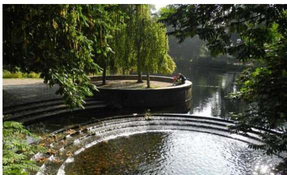
Figure 6: Reclaiming a Sacred Space

The site or any space in the city is live a living a cell in a body. Every space contributes to the goodness of the city. Every space should be treated and planed very sensitively considering the ecology and sensitivity towards flora and fauna .The land should be celebrated and not just be used as a commodity.