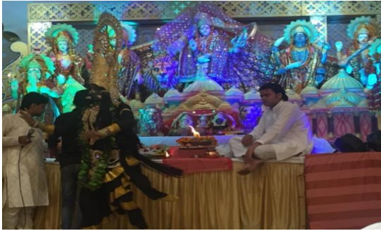
Figure 5: Multifunctional Spaces, Tatiya Van, Nathdwara