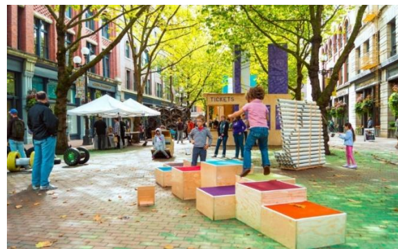
Figure 10: Pop up Intervention Changing Our Cities

This can be achieved by introducing certain concepts and factors: