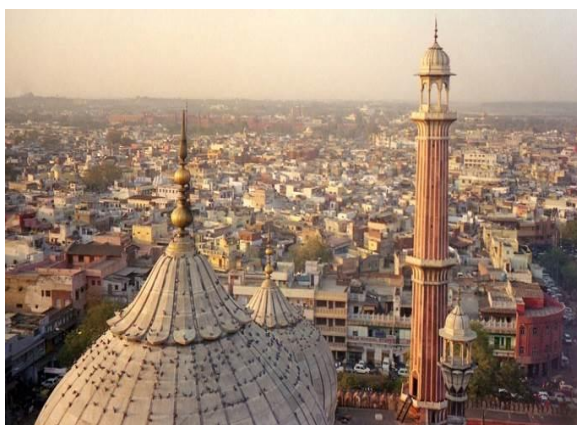
Figure 1: Jama Majid, New Delhi