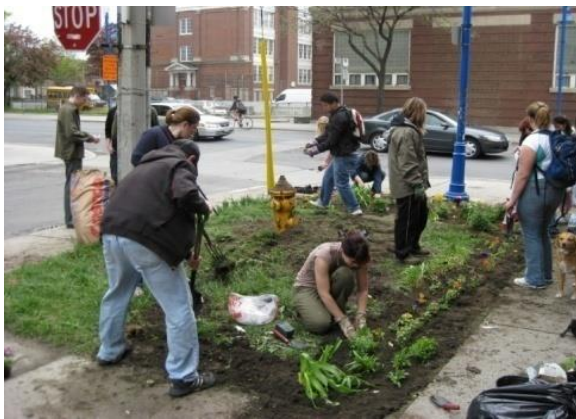
Figure 11: Guerilla Gardening

Guerilla Gardening was initiated by Liz Christy and her green Guerilla group in 1973 in New York. They transformed a derelict private lot into a garden. The space is still cared for by volunteers and enjoys the protection of the city's park. [4]