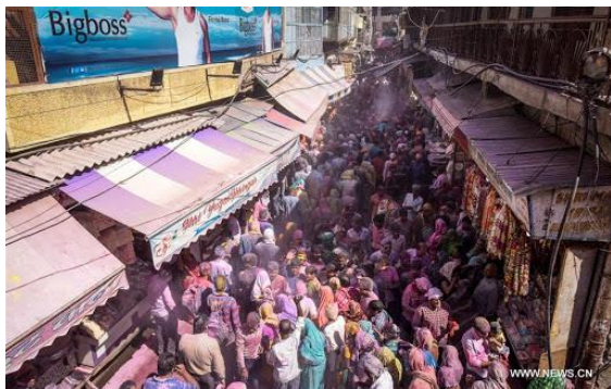
Figure 13: Sacred Street of Varanasi