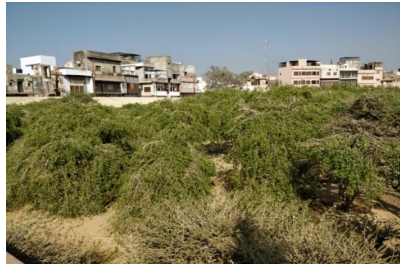
Figure 3: Tatiya Van, Nathdwara