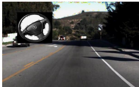
Figure 6: Car Running Result during Left Turn