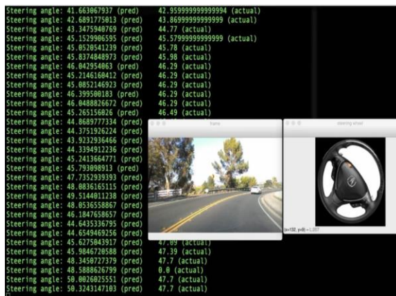
Figure 7: Car Running Result during Right Turn