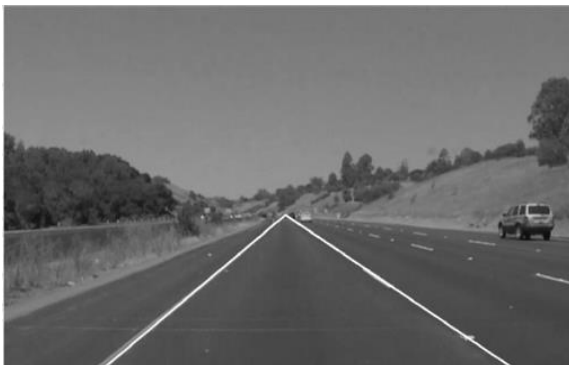
Figure 3: Data Set for Angle