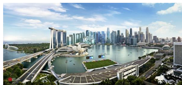
Fig 1: Singapore Waterfront

With industrial era, this relationship was interrupted due to some uses, such as huge ports, commercial, industry, warehouses and transportation. Through the evolution of containerization technology, port activities moved to outside the city. Accordingly, industrial plants were abandoned and forms of transportation changed. Also with the increasing environmental awareness and as a consequence of the pressure for upgrade in a urban areas, waterfronts were rediscovered in the city. So, phenomenon of waterfront regeneration emerged. Urban waterfront regeneration projects have become an effective tool for urban planning and politics an international dimension since 1980's.