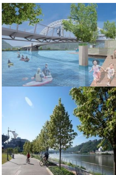
Fig 7: Pittsburgh Riverfront Proposal