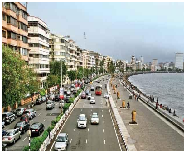
Fig 4: Marine Drive Waterfront, India (Now)