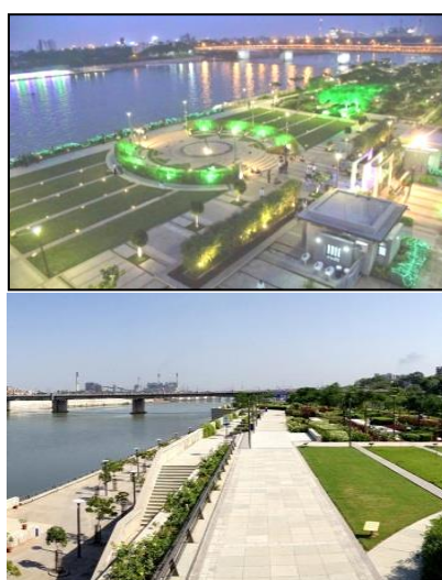
Fig 8: Sabarmati Riverfront

The project aims to reclaim the private river edge as a public asset and restore the city's relationship with its river. The Riverfront project presents a great opportunity to create a public edge to the river on the eastern and western sides of Ahmedabad.