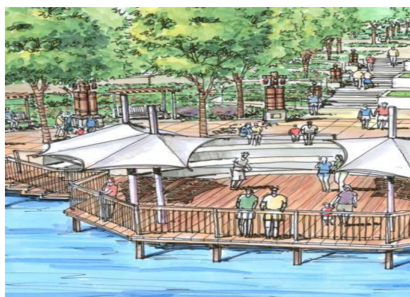
Fig 9: Development of Public Spaces

The costs of a project should be assessed given risks including those from climate change, initial capital costs, ongoing maintenance requirements, and other factors. Project designs should be assessed for the economic burden it places on owners and stakeholders. Analyses of a project's vulnerability to and consequences of changing coastal conditions due to sea level rise and coastal flooding should be considered in determining the cost-effectiveness of designs.