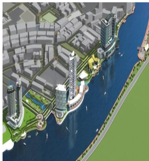
Fig 6: Kuching Riverfront

The main objective of this development proposal is to strengthen the commercial and recreational activities which reflects character, social, culture & identity of the place. The design considers visual character and quality of the place as a riverside marketplace.