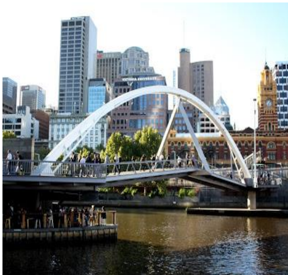
Fig 5: Sabarmati Riverfront & Melbourne Riverfront