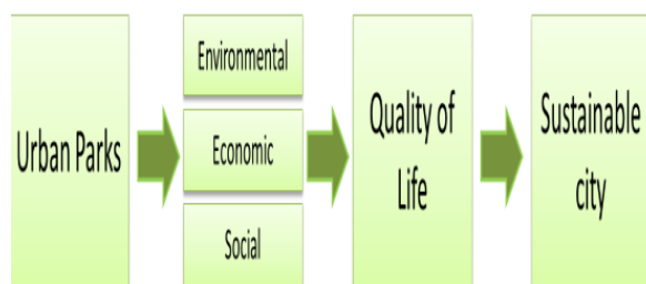
Fig 1: Urban Parks and City Sustainability