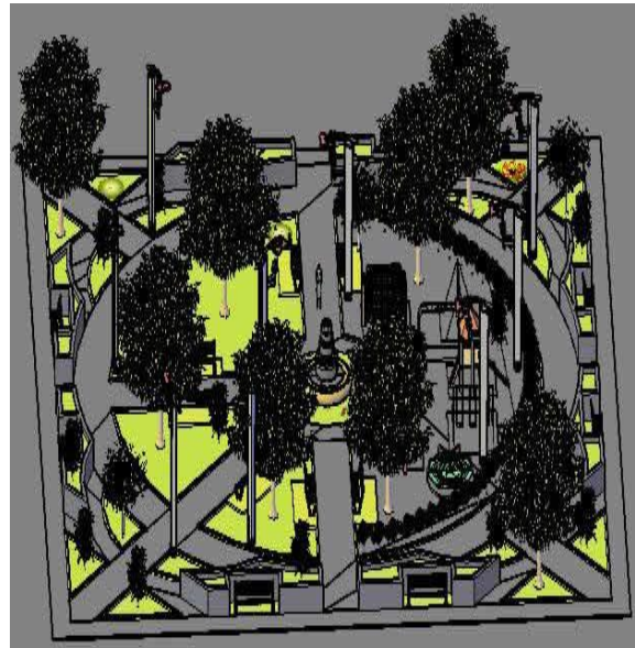
Fig 4: A Sketch of a Typical Recreation Facility

Secondly as they are integrated into the urban fabric, they will play a role in solving larger urban problems.