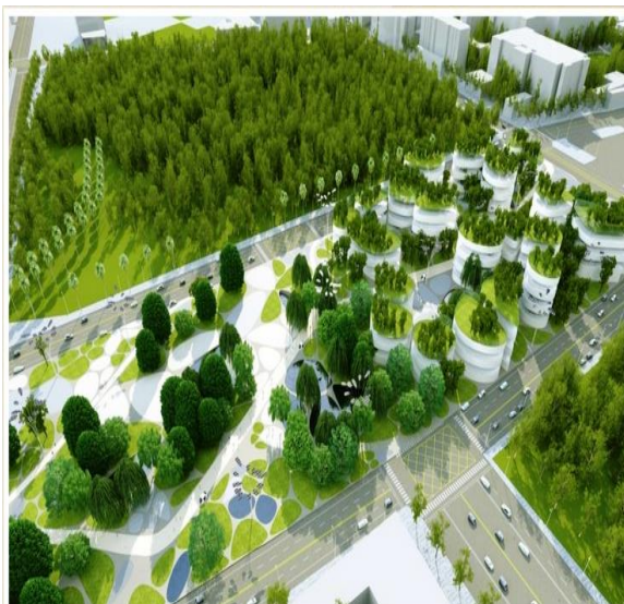
Fig 5: Eco-Park as a New Model in Park-Design

The parks are public green areas. The areas generally have abundance of trees and plants, grass and various facilities (such as benches, playgrounds, fountains and other equipment) that allow enjoying the Leisure and rest. Ecological, for its part, is an adjective that refers to what is linked to the ecology. This latter term (ecology), in its broadest sense, mentions the interactions that maintain living beings to the environment.