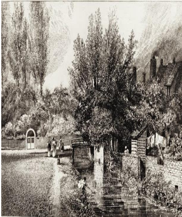
Fig 3: A Sketch of a Typical Reform Park