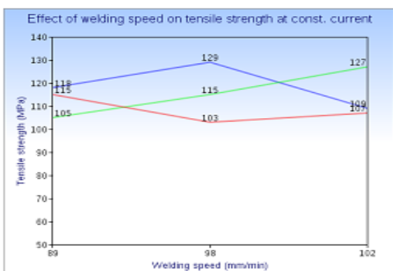
Fig 3: Effect of Welding Speed on Tensile Strength

Aluminium alloy GTA welding filler rod. An inert gas mixture of Argon/Helium (50/50) was used as shielding gas as it helps in the constriction of arc and concentrates the heat within a restricted weld nugget area, thereby reducing the size of the heat-affected zone (HAZ). Lack of fusion (LOF) is generally caused due to low welding voltage and low welding speed. Post-weld heat treatment (PWHT) was performed to improve tensile properties of welded specimens. The ultimate strength for the six defect-free tensile specimens ranged from 170 MPa to 182 MPa, averaging 177 MPa. Specimens with voids had an average tensile strength of 162 MPa while their toughness was 8.3 MJ/m 3 . About 7% improvements in ultimate tensile strength (UTS) and 16% improvement in yield strength (YS) observed in the age-hardened (AH-10h) specimens.