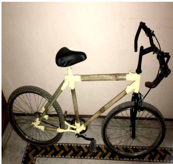
Fig 4: Our Bamboo Bicycle Ready for Riding

After two weeks to fit all the parts and adjusting them for smooth running of the bicycle.