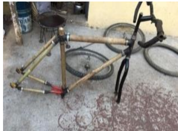
Fig 3(b): After Coating the Joints