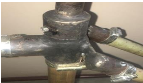
Fig 2: The Bush and Clamp Joining System

The bicycle frame consists of straight bamboo pieces connected to each other via suitable joints. There are many methods to join bamboo pieces with the help of bolts, nuts, ropes, glues, etc. [0]. Some of these techniques tested the joints for strength. Joints having glue (fevicol) and bolt and nuts failed and finally we made a clamp-type joint in which steel pipes were welded to each other and bamboo pieces were clamped in them as shown in figure 2.