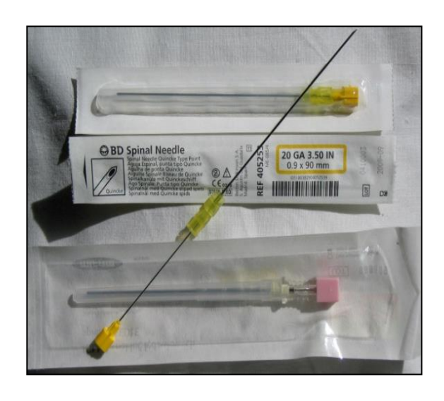
Fig 4: Lumber Puncture Needle