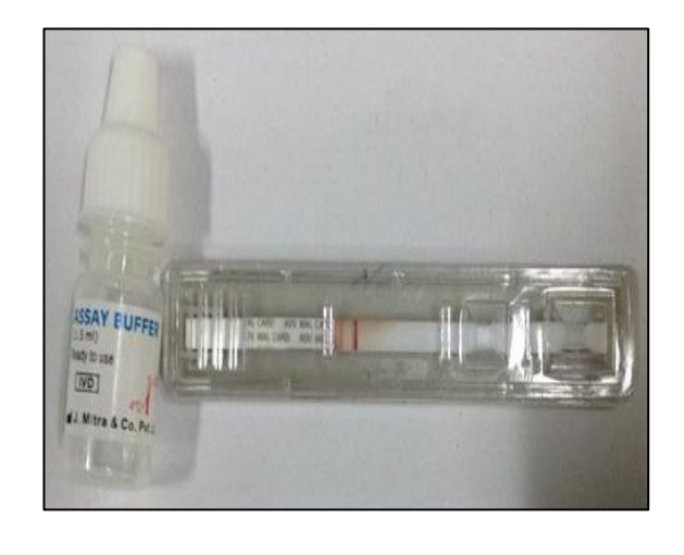
Fig. 3 Malaria Card

When the complex meets the line of the corresponding immobilized antibody, the complex is trapped forming a purplish pink band which confirms a reactive test result. Absence of a coloured band in the test region indicates a negative test result. To serve as a procedural control an additional line of anti-mouse antibody has been immobilized on the strip as control.