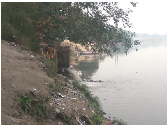
Figure 2: Tonga Stand Drain