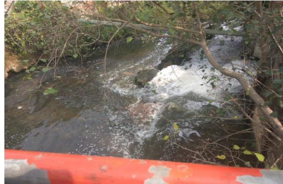
Figure 4 : Metcalf House Drain (Bela Road)