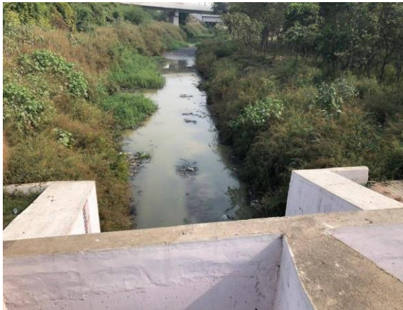
Figure 2: Tonga Stand Drain