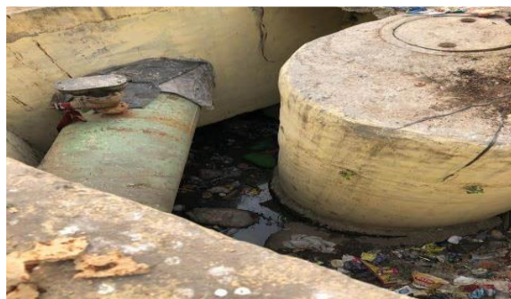
Figure 7: Arunanagar Drain