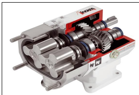
Fig 3: Lobe Rotor Pump

of the pump, which can be defined by the direction of rotation of the drive. This vacuum draws the liquid into the pump chamber. With further rotation, the pumped medium is conveyed past the pump wall into the pressure area. Up to six chamber charges are displaced with each drive rotation— depending on the rotor type. When the rotor is at a standstill, the pump seals off almost completely.