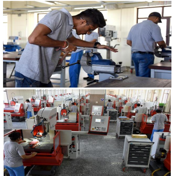
Figure 3: Field of Skill Development

It has world class infrastructure shown in figure 3 and machinery. The world class cnc machines and conventional machines are imported from various countries like Austria, Japan, Germany and Switzerland. This university is based on the Swiss dual system and the master trainers are providing training.