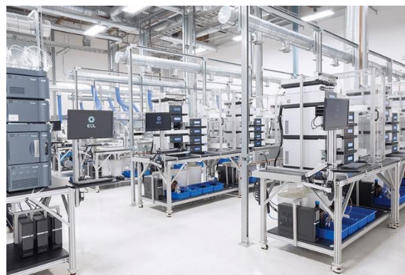
Figure 4: The Laboratories 5