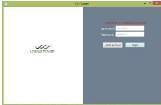
(b) Login Interface at Charging Station for the Customer