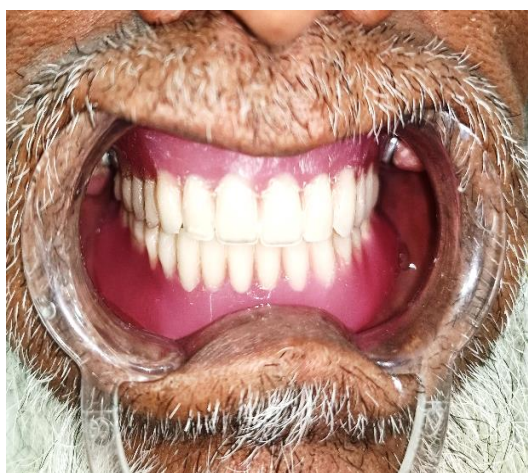
Figure 6: Denture Insertion After Cheek Plumper Attached