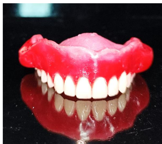
Figure 2: Try in Pt. Mouth