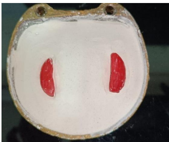
Figure 5: Floating Plumpers