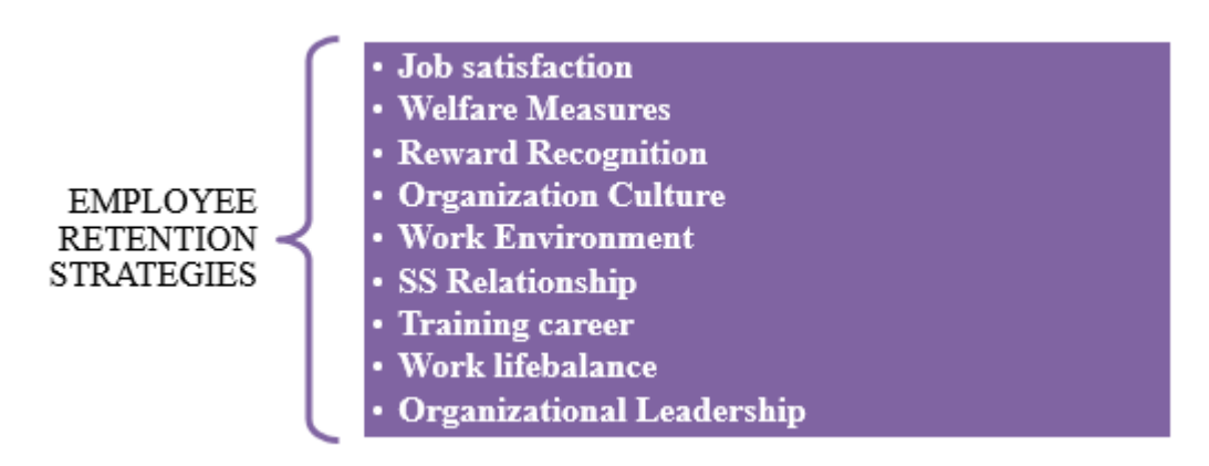
Figure 1 – Conceptual Framework for the study

The literature available was reviewed and used in conceptualising the concepts differentiating human resource practises. The various components such as job satisfaction, rewards and recognition, training programs, organisational culture, work-life balance, superior-subordinate relationships, and working environment have been identified and will be used in the present research.